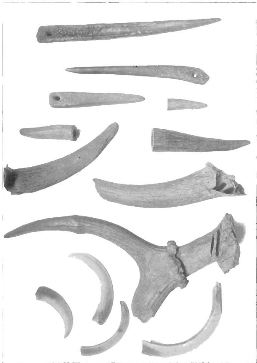
PREHISTORIC REMAINS FOUND IN THE PITHAY.