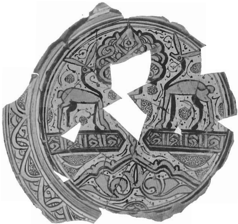
PLATE IX.—HISPANO-MOESCO DISH FOUND IN BRISTOL.