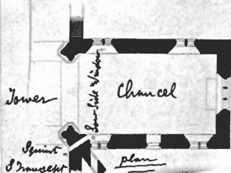
OUTSIDE AND INSIDE VIEWS, AND PLAN, OF LOW SIDE WINDOW AT S. MARY OTHERY.