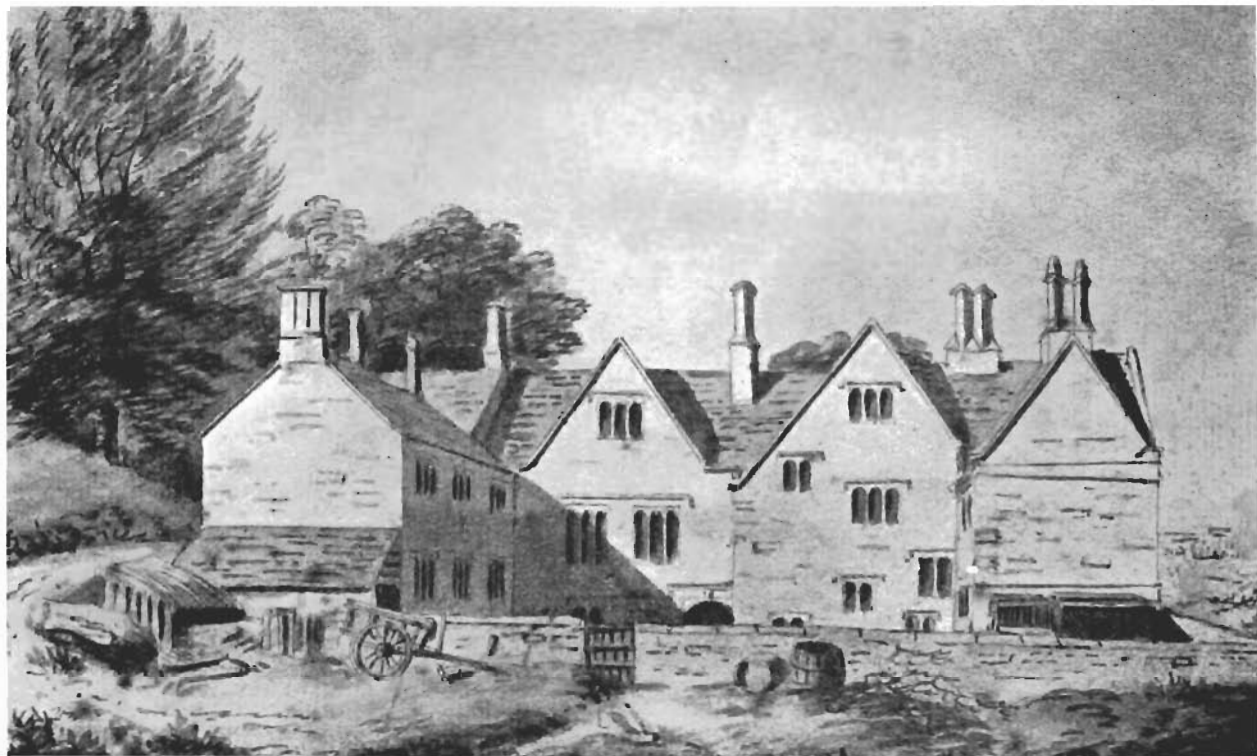
PRINKNASH HOUSE (NOW PRIORY) From a drawing by Samuel Lysons, F.S.A., c. 1790