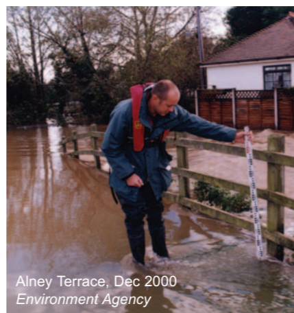
Alney Terrace, Dec 2000 Environment Agency