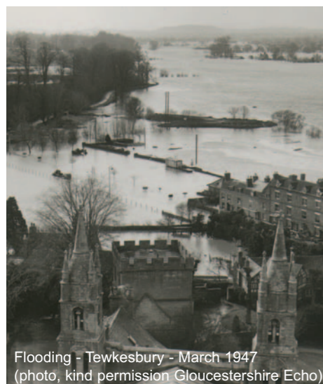
Flooding - Tewkesbury - March 1947