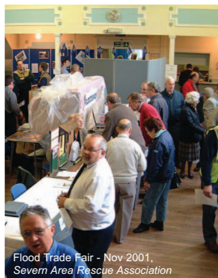
Flood Trade Fair - Nov 2001, Severn Area Rescue Association