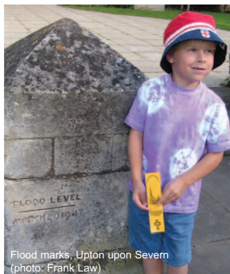
Flood marks, Upton upon Severn