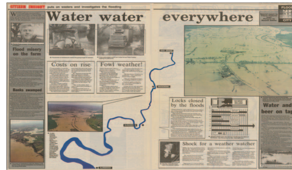
Newspaper photo, with kind permission from the Gloucestershire Citizen